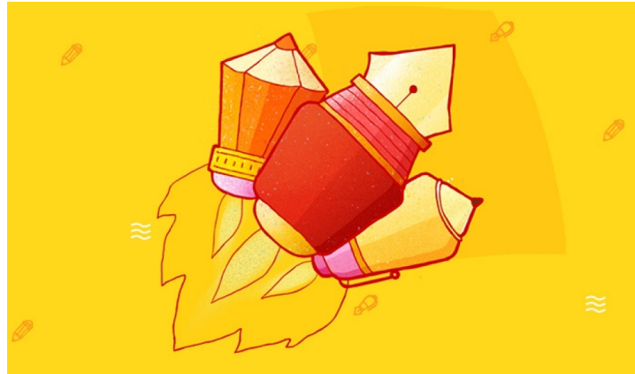
Illustration: School Press Club

The teacher can attach comments to the draft texts. All members of the editorial staff have the opportunity to